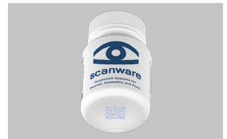
Aggregation via a helper code